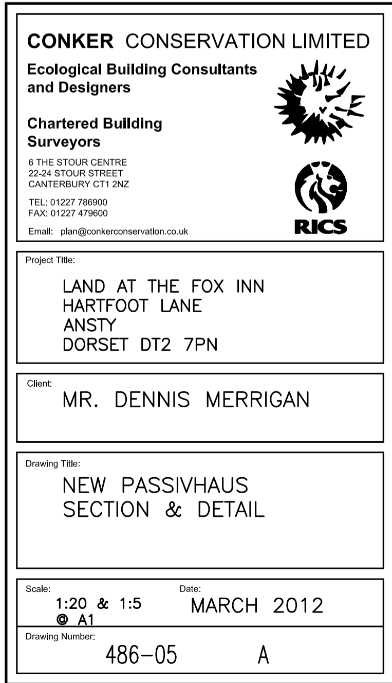
SECTION (SCALE 1:20)